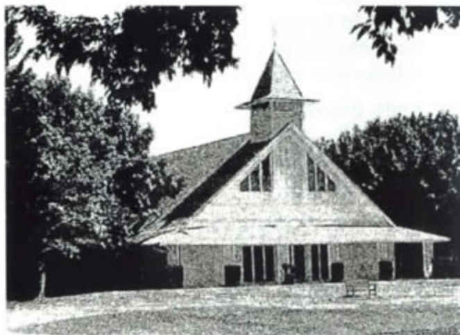
The Chapel of Saint Andrew

*Healing first Sunday of each month Child Care is provided at all services.